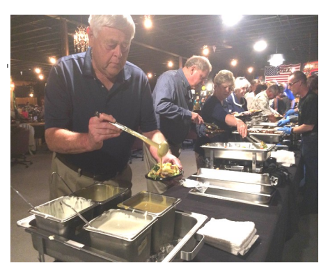
Guests enjoy the wonderful buffet served by Texas Roadhouse