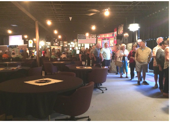
The food line was long, but moved very quickly