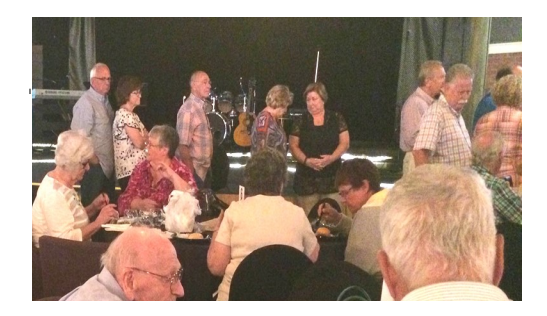
The food line dwindles down. It's almost show time!