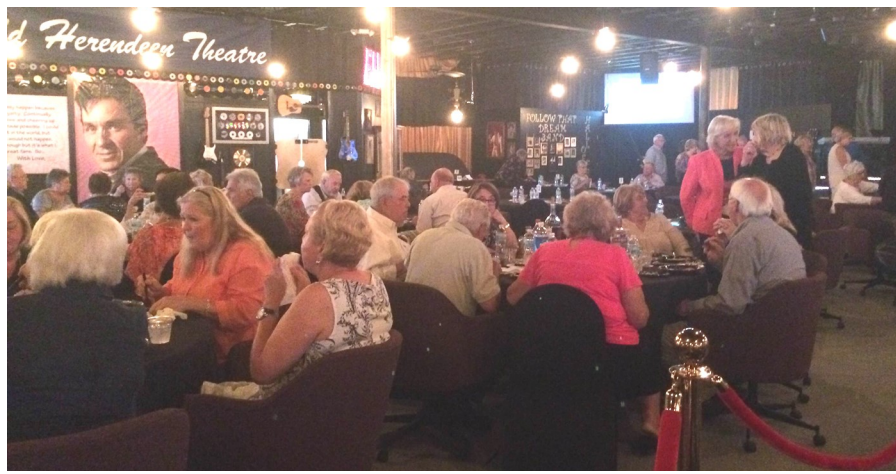
Laughter fills the air as guests enjoy their meal amid the fun atmosphere.