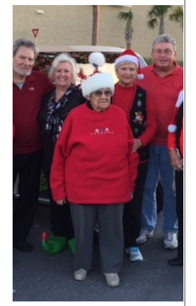
Christmas Parade 2014

FOR 30 YEARS OF SERVICE TO THE WOMEN'S CIVIC CLUB OF PANAMA CITY BEACH, INC.